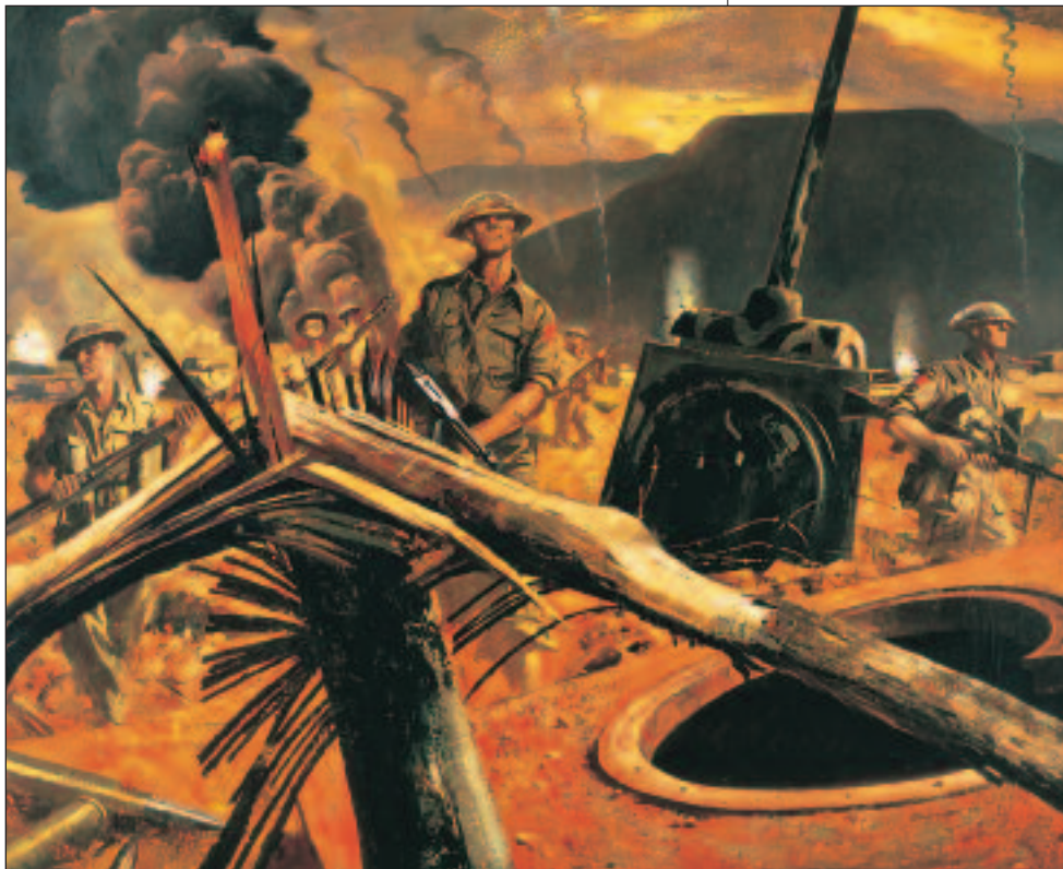
Canadian infantry in action during the Italian Campaign. The Hitler Line, 1944, by Charles Comfort.

historians trying to understand human behaviour in war. No disrespect to Lieutenant-Colonel Grossman is intended by this article, and it is not meant to devalue his work. I personally believe that some of the elements of his books, particularly the physiology of combat, would actually be strengthened if they were not shackled to the idea that humans cannot kill one another. But there are still questions that need to be asked, and the subject should not be considered closed. Grossman's overall picture of killing in war and society is heavily informed by a belief in an innate human resistance to killing that, as has been offered here, does not stand up well to scrutiny. More research on the processes of human killing is needed,